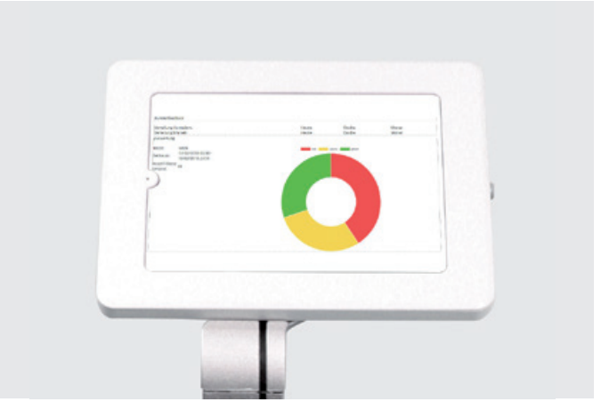
Illustration: Evaluations and analysis of the feedback